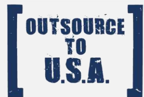
Outsource to U.S.A.

THE BRONX BROOKLYN MANHATTAN QUEENS STATEN ISLAND