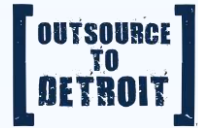
Outsource to Detroit GalaxE.Solutions O2D