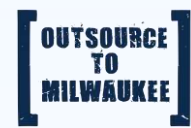
Outsource to Milwaukee GalaxE.Solutions O2M