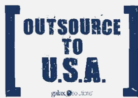
Outsource to USA