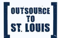
Outsource to St. Louis O2StL