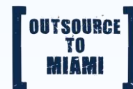
Outsource to Miami O2Miami O2MIA