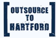
Outsource to Hartford GalaxE.Solutions