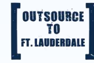
Outsource to Ft. Lauderdale